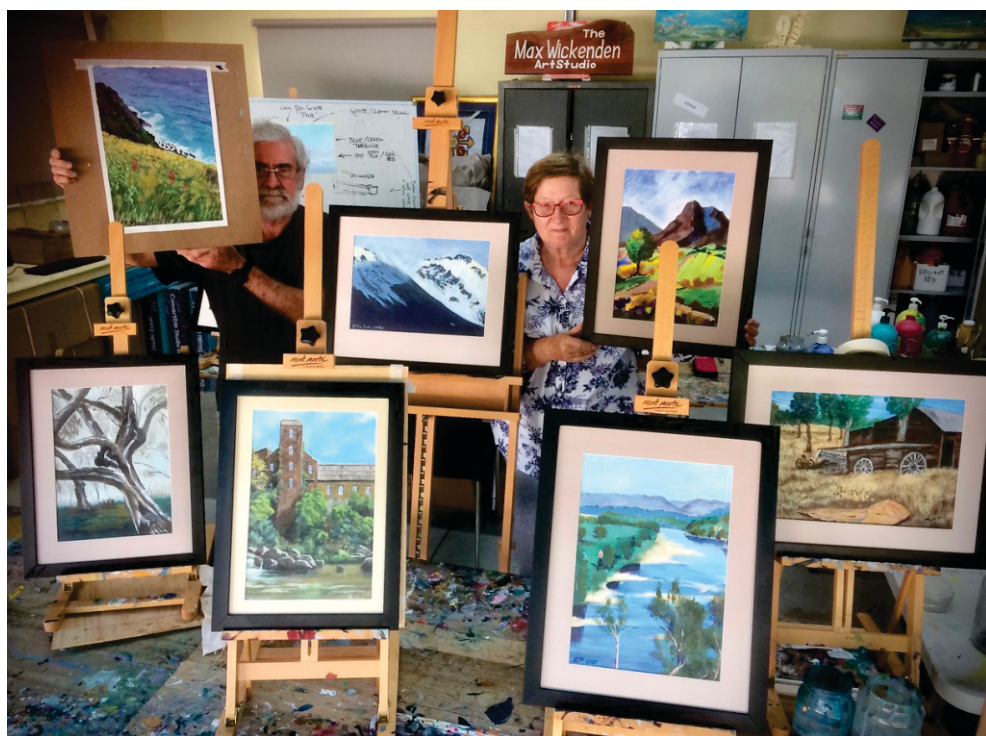
Art class capturing the moment