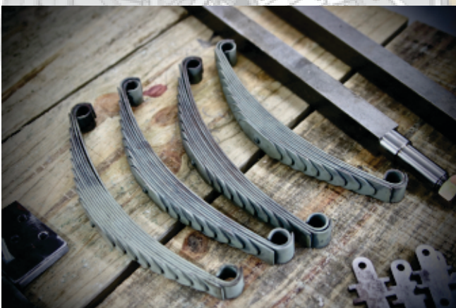
Leaf springs to support the traction engine