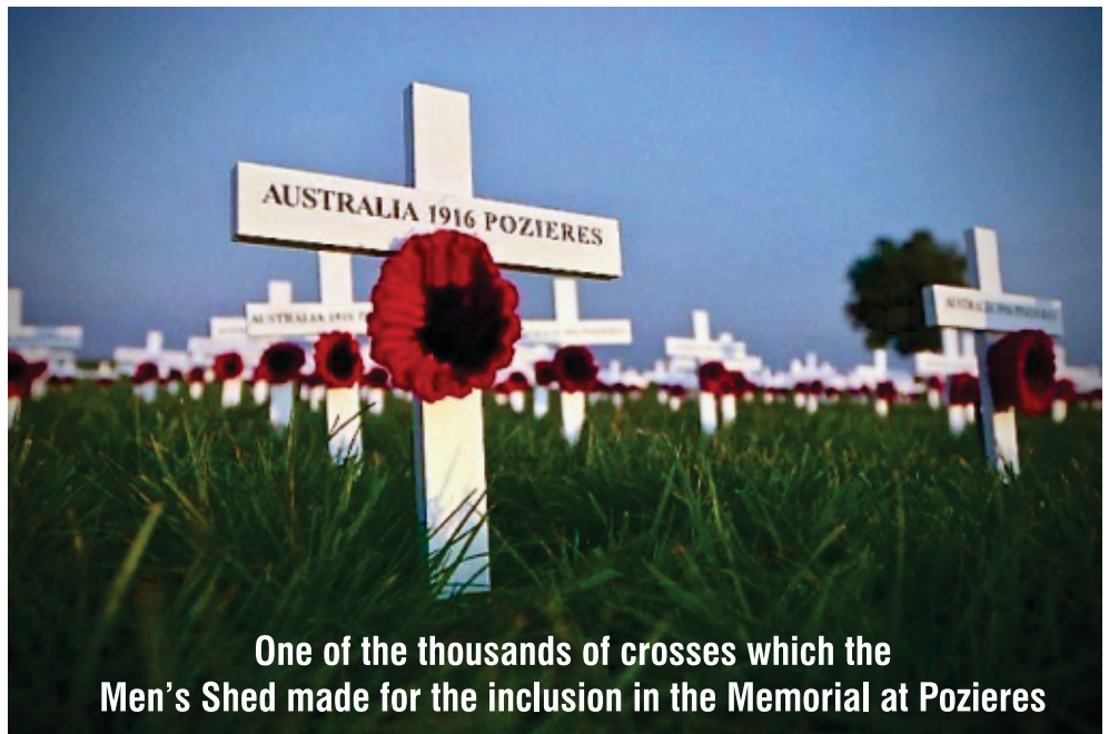
One of the thousands of crosses which the Men's Shed made for the inclusion in the Memorial at Pozieres

For the work carried out by the Mens Shed in supplying some of the crosses, a brick used in the building of the Pozieres Memorial Park was purchased in the name of "Brisbane Centenary Suburbs Men's Shed Brisbane Queensland," The brick is numbered 1010 and is located in the Pozieres Memorial Park France.