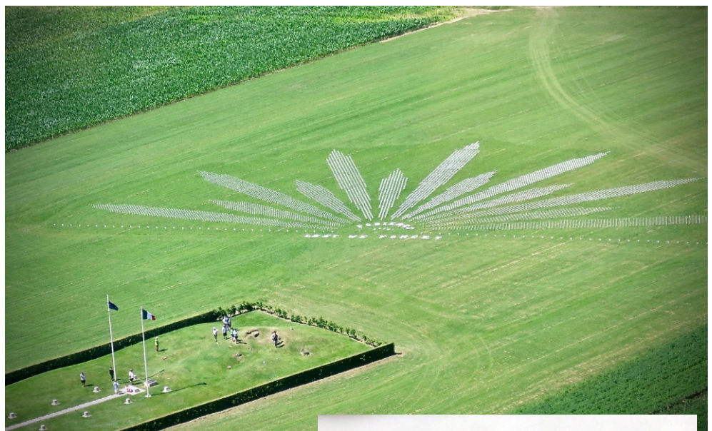
An aerial view of the rising sun which is made up of some 7,000 crosses representing the number of Australian Diggers killed at Pozieres