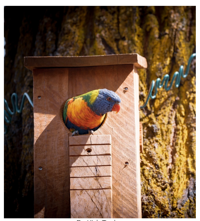
By Kirk Taylor

At Council's request the nest boxes were purpose built by our members to suit Rainbow Lorikeets and similar sized birds. Subsequently installed by Council at the appropriately named Lorikeet Park, lorikeets wasted no time in occupying new bird boxes, as evidenced in the photograph. The park, located in Dandenong Road opposite Mount Ommaney Centre, was so named in recognition of the birdlife that relied, for many decades, on the hollowbearing trees that existed in the bushland in and around this site.